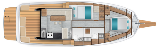
Lower deck - 2 cabins / 2 heads